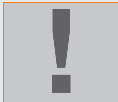
4 Make informed decisions to efficiently manage EZiCAT fleet and operators