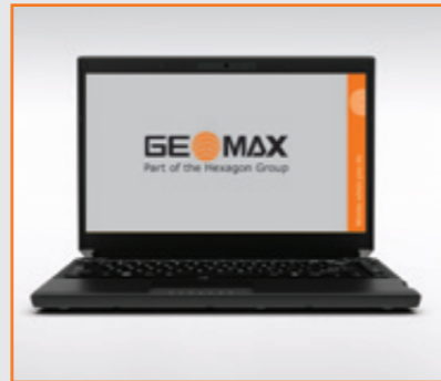
2 Send logged data to Bluetooth® enabled PC