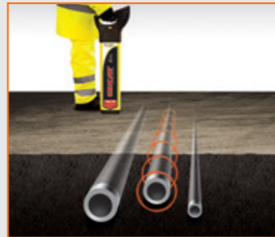
1 Conduct ground survey gathering data

See better results, more comprehensive ground surveys and a reduction in buried service strikes.