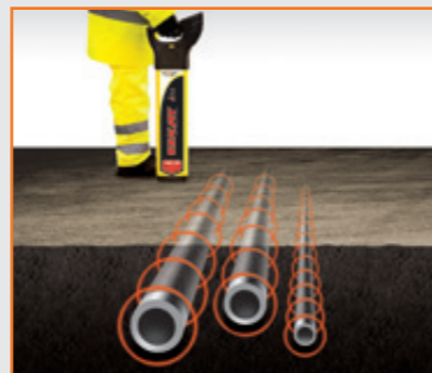
5 Implement changes to procedures for better results